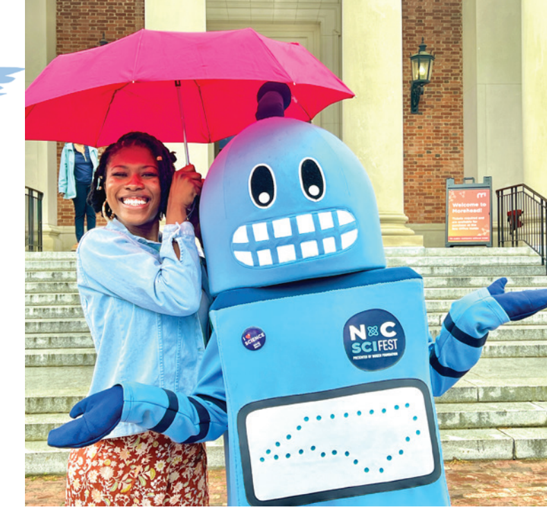
APRIL SHOWERS BRING STEM FLOWERS! This April saw some rainy weekends across much of the state, but that didn't put a damper on the fun!