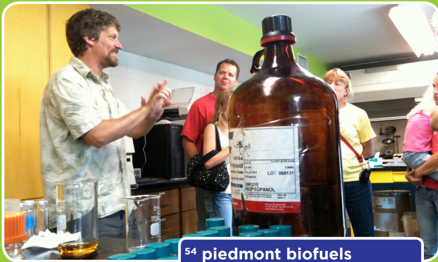
54 piedmont biofuels

The North Carolina Science Festival is a statewide celebration of science and its impact on education, culture and economics within North Carolina. The first North Carolina Science Festival spanned Sept. 11-26, 2010 and was the first-ever statewide science festival in the United States. UNC's Morehead Planetarium and Science Center founded and coordinates the festival, with participation by museums, parks, community sites and other facilities throughout the state.