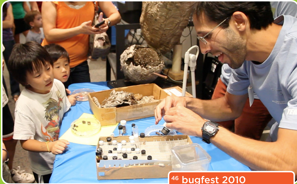
46 bugfest 2010

16> Carolina Beach State Park, Carolina Beach, Animals of the Park, Carnivorous Plant Hike, Poisonous Plants and Animals, River Exploration Hike.